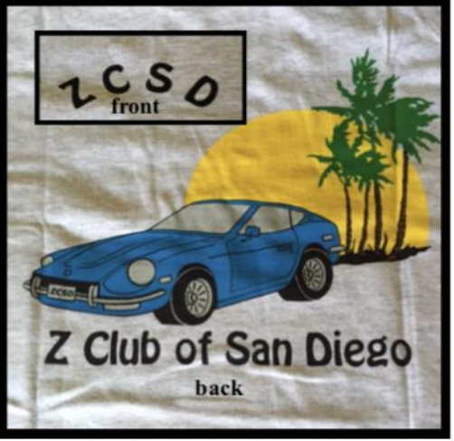
VINTAGE CLUB SHIRTS $10.00