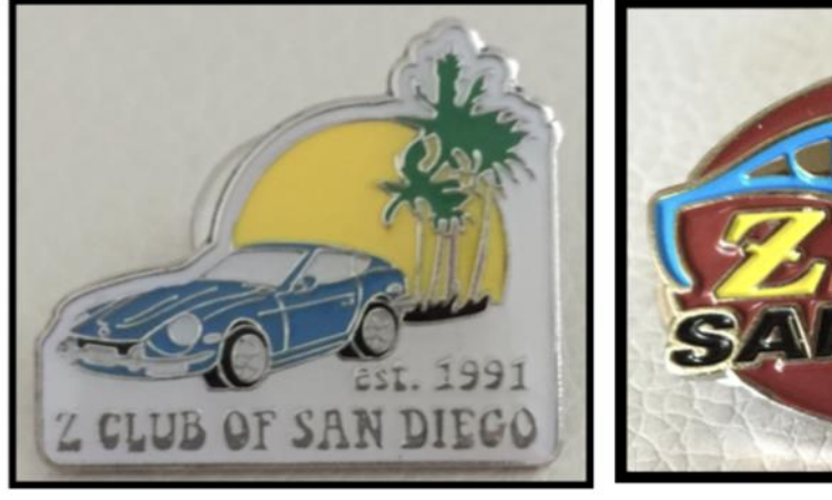
VINTAGE CLUB PINS $5.00 each