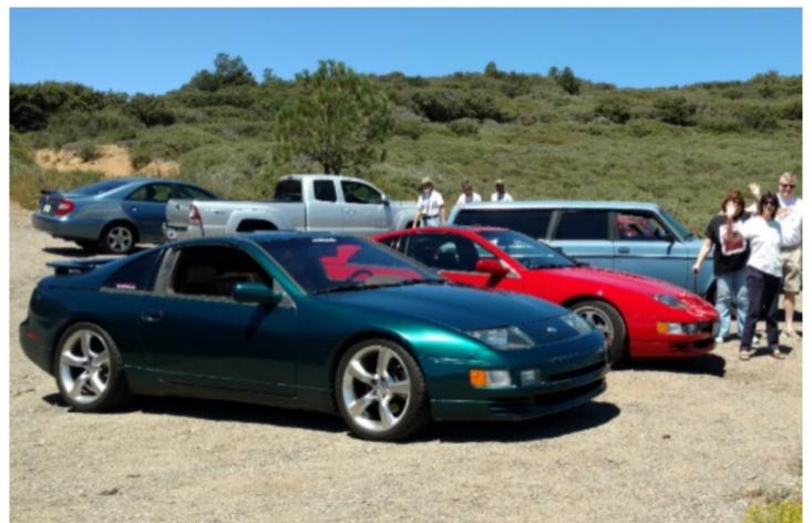
Our club outing was a favorite from our ZCON 2014