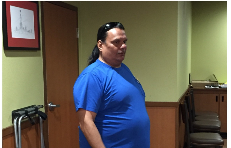
Great turn out in our August General Meeting , our guest speaker discussed the new technology in tinted glass films. New clear glass films that protect from dangerous sun rays.