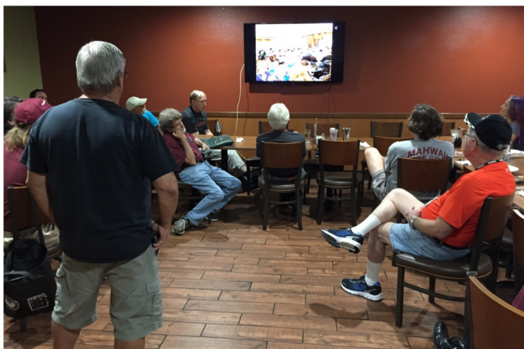
Video presentation from ZCON 2017