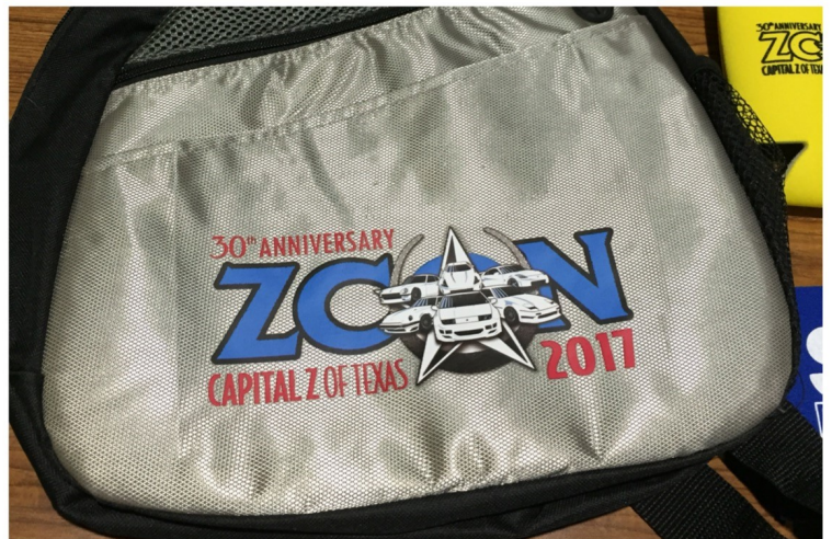
Great items for raffle from ZCON 2017