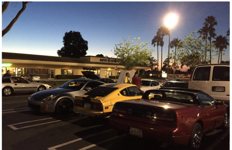
Nice display of Z cars at the General meeting