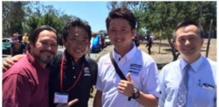
Plenty of smiles and selfies