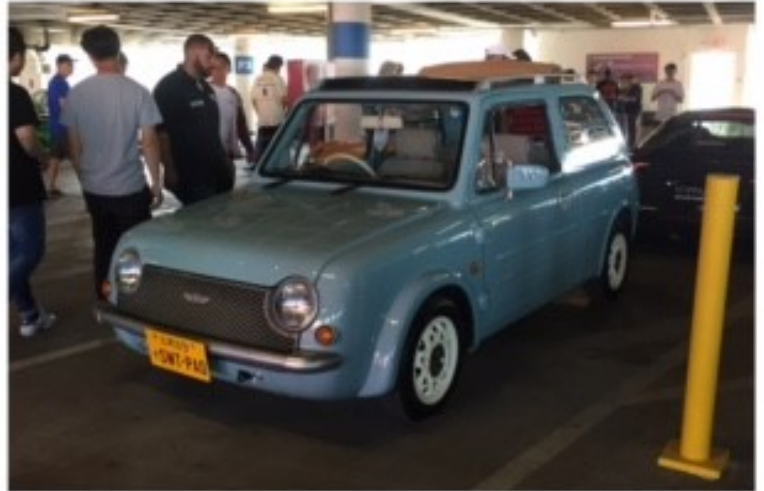
Some awesome cars to include Suki's Honda S2000 from Fast and the Furious, Nissan Pao,