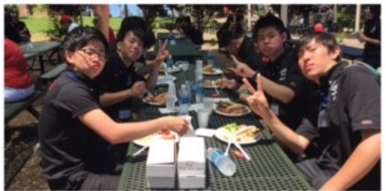
The food was great , burgers , hotdogs , BBQ chicken and Tri-Tip with salads n chips . The students enjoyed the 'American'' food