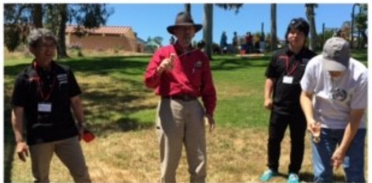
Some of our members tried the Kendama