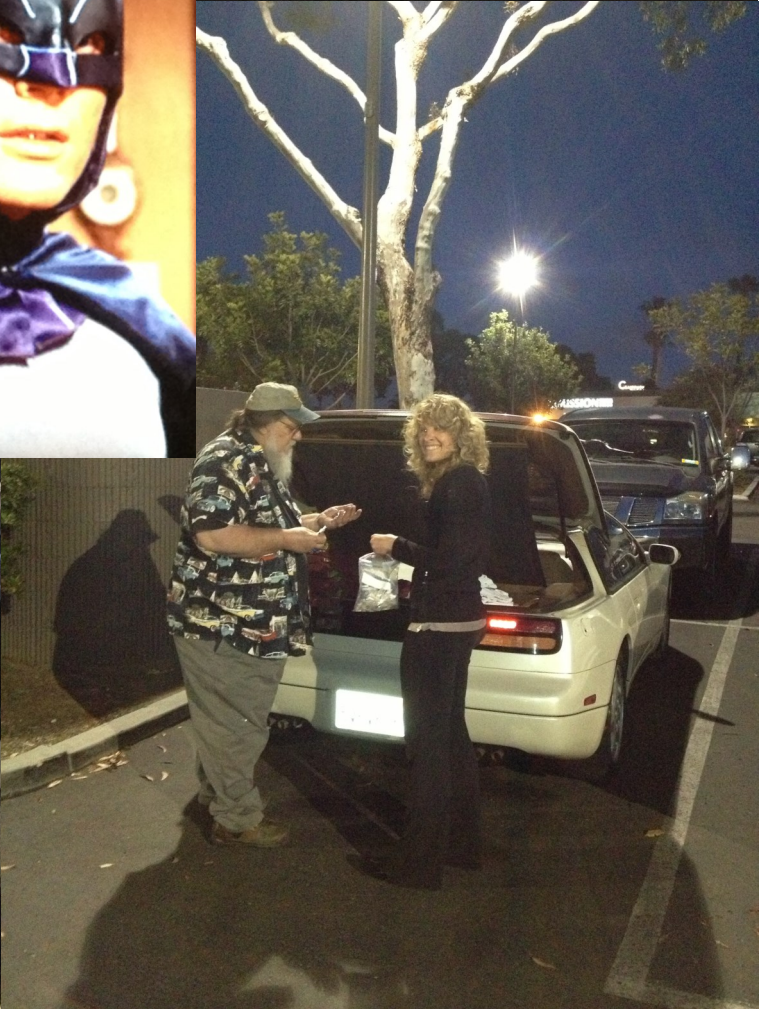
Z CARS WILL MAKE AWESOME BATMOBILES