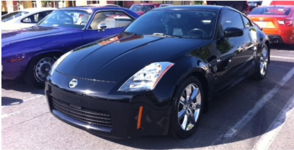
ZCCIV at Cars and “Cosi” , Cosi Restaurant parking lot in Temecula