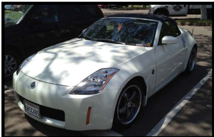
Pat Connolly 350Z