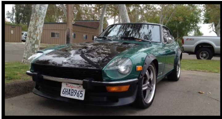
Hulk Machine 260Z