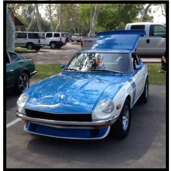
Wally Cook 240Z