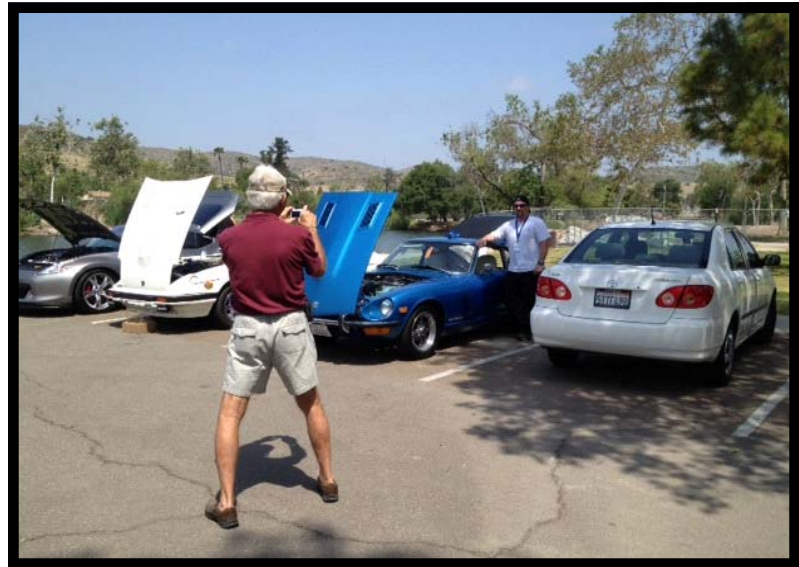
Clif's photo shop