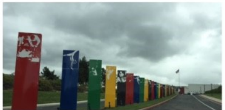
One of the stop was the beautiful Chula Vista Olympic Center