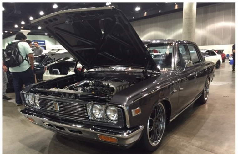
The Hulk Machine representing Z Club of San Diego among all the old school beauties like Rich 240Z RB swap wide body Z.