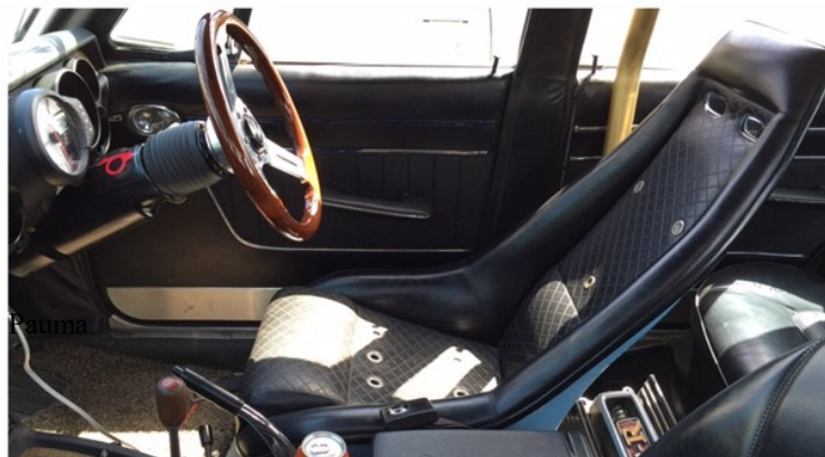
Lunch at Casino Pauma