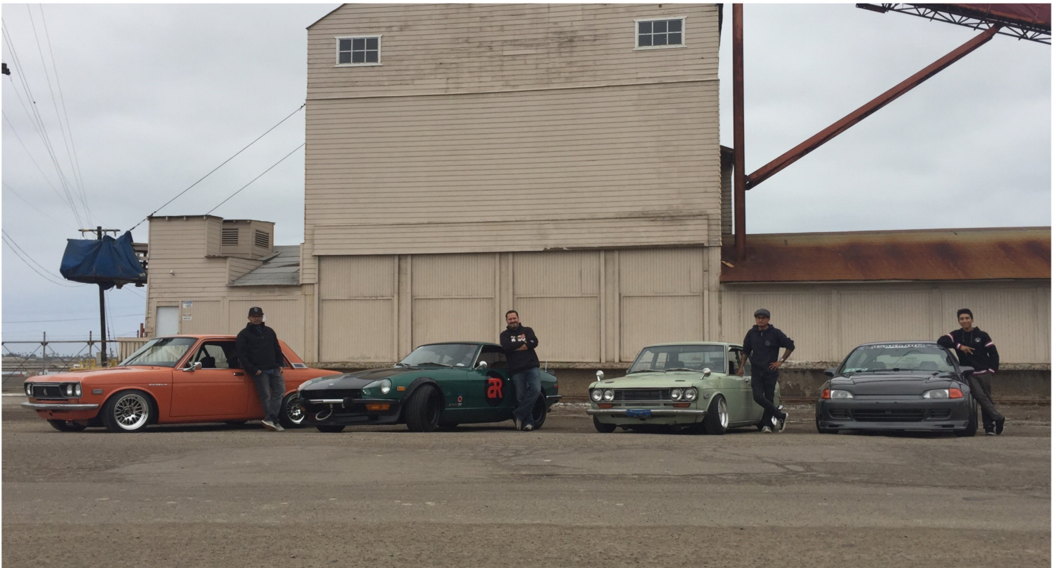
A little visit to the Chula Vista Salt Fields with some cool people and cars