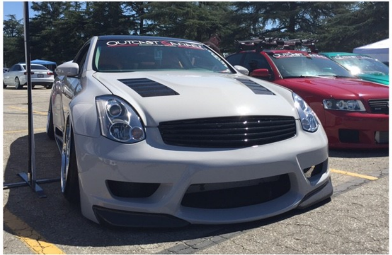
The old School car look just at home surrounded by the new models