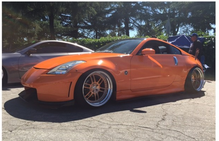
Plenty of Z car and Nissan GTR's