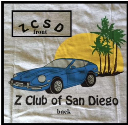
VINTAGE CLUB SHIRTS $10.00 (limited sizes)