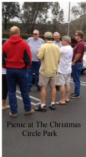
Picnic at The Christmas Circle Park