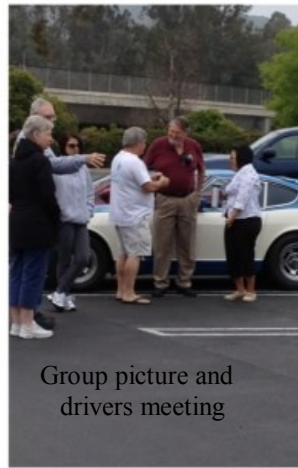
Group picture and drivers meeting