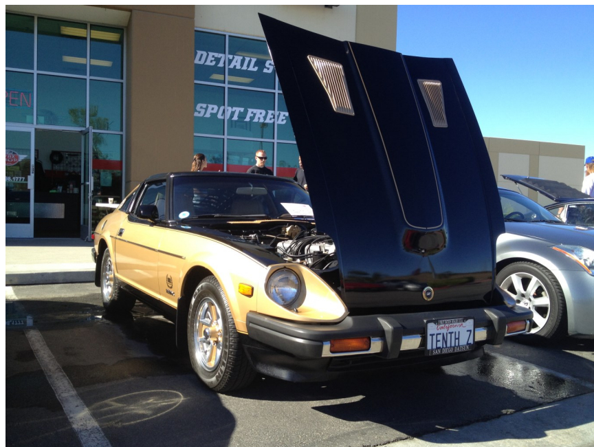
Fred Jordan's 10 th Anniversary Black Gold 280ZX at the ZCCIV 2012 car show