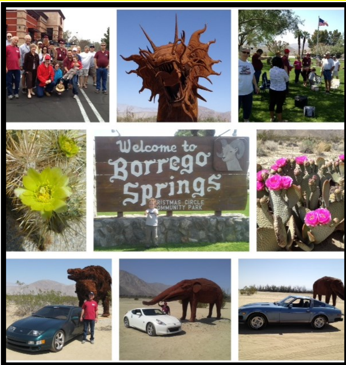
Anza Borrego Run

NEXT GENERAL MEETING IS APRIL 2 ND AT DENNY'S in the Clairemont Square Shopping Center (See Page 2)