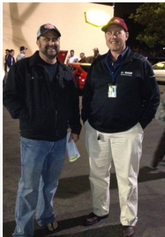
Plenty of Z cars and comradery at the parking lot