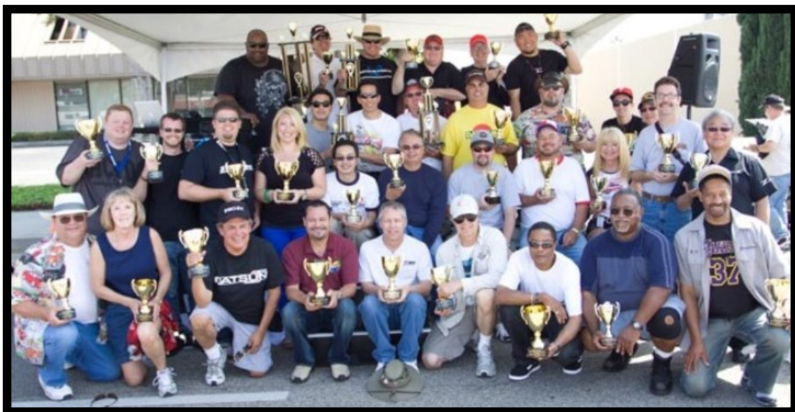
2012 Motorsport Auto Z-Car West Coast National Trophy Winners

ZCSD Monthly outing is going to be The 2013 Motorsport Auto Z-Car West Coast Nationals. It is a three day event starting Friday evening, April 26 th at 6:00 pm. Take note you may need to register for the different activities that are taking place, even when some of them are free of charge. Visit their web page for more information and details : www.zcarparts.com