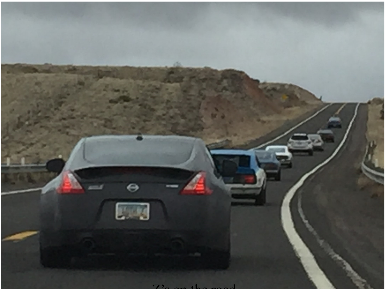
Z's on the road