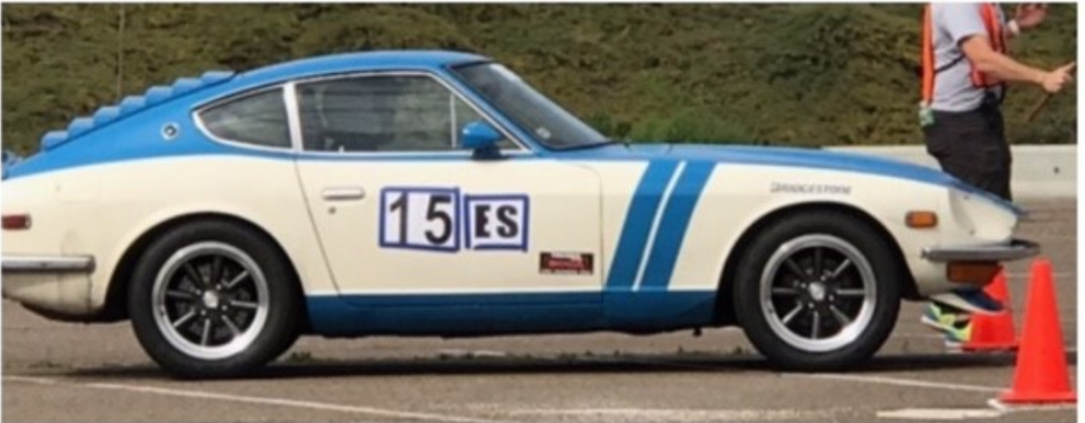
Wally Cook representing ZCSD at the SCCA Tire Rack CAM Challenge