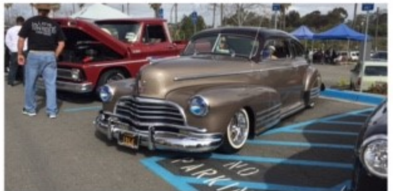
Great display of cars from classic to customs and old schools