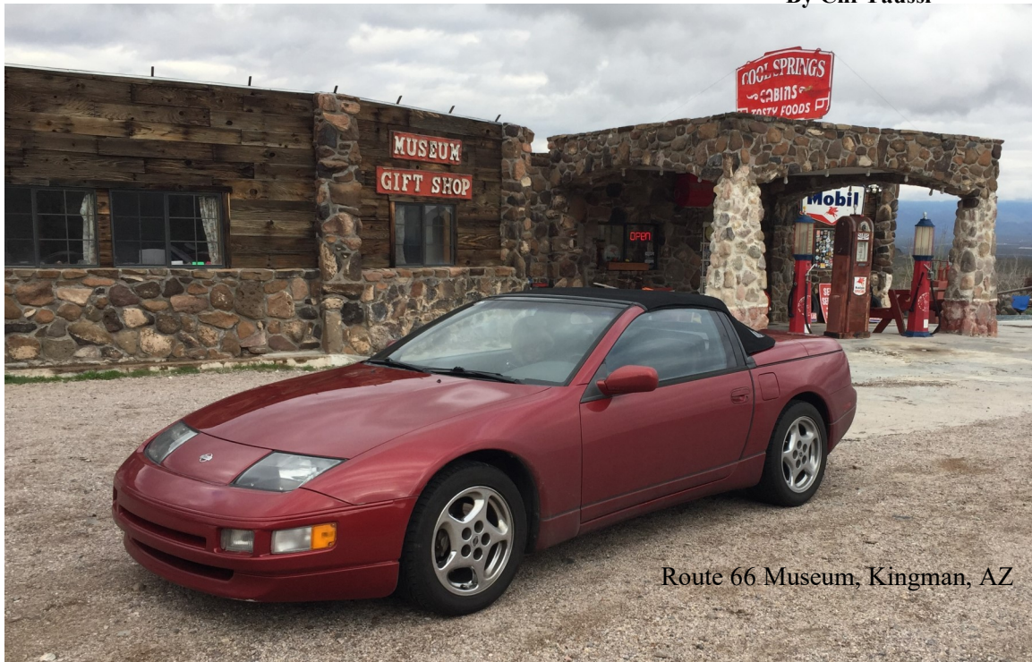
Route 66 Museum, Kingman, AZ