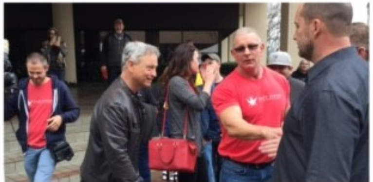
Good day indeed got some photos with chef Robert Irvine the pretty girls from Criminal Minds and lucky enough to win one of 7 awards.