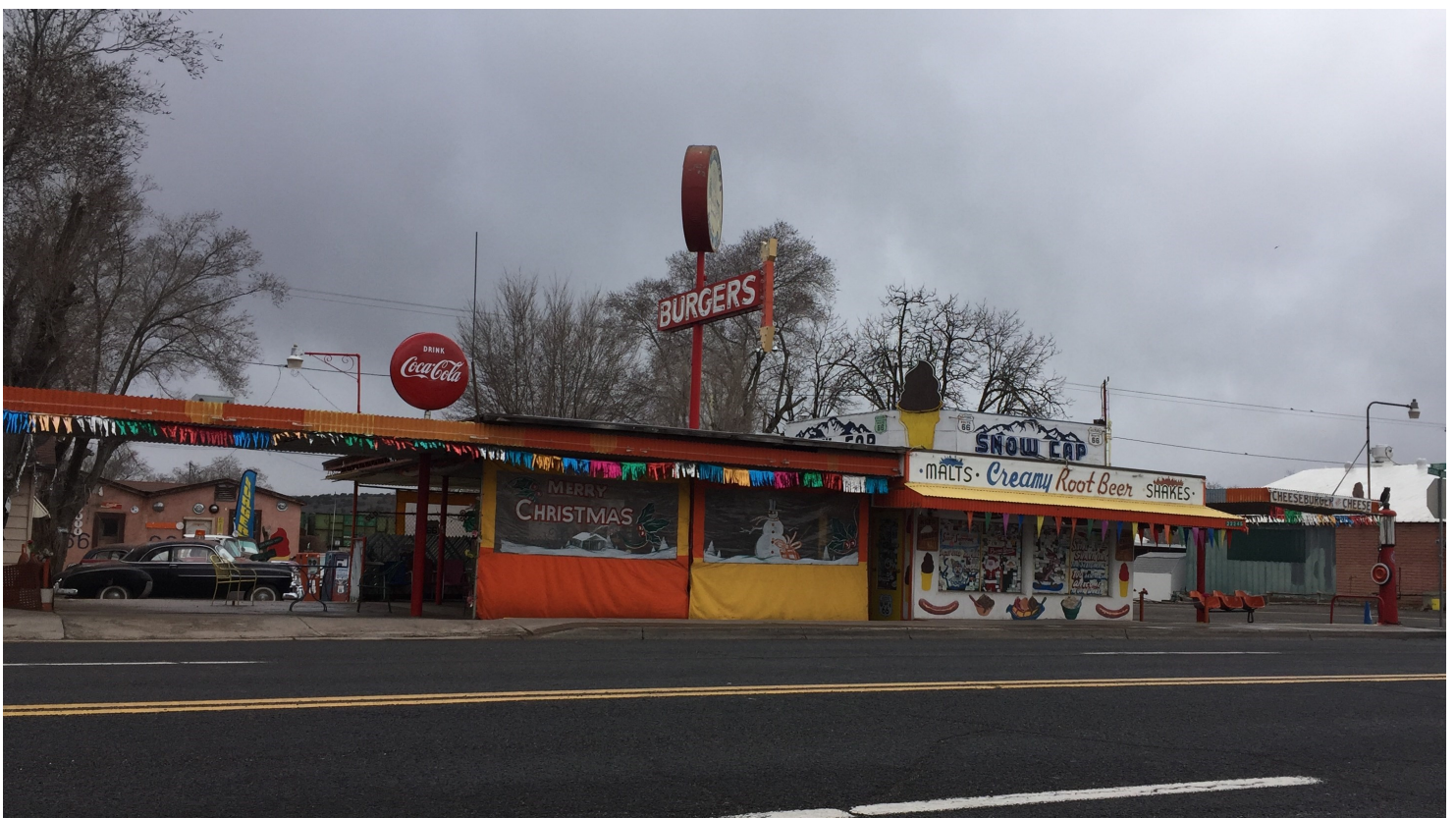
Snow Cap Café, Seligman AZ