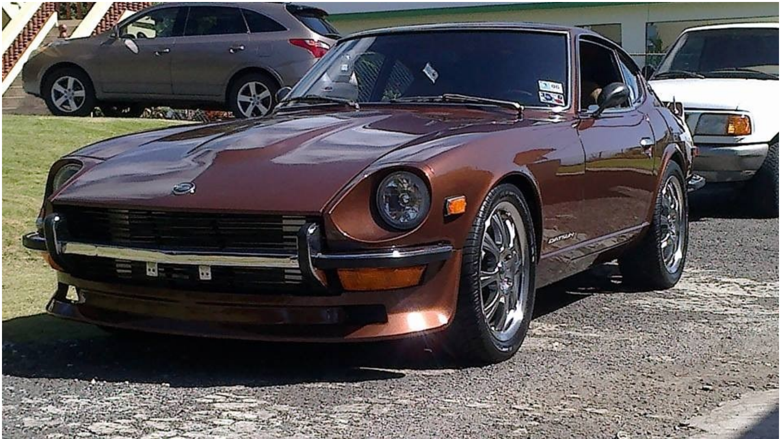
This chocolate beauty belongs to Domingo Morales. This is an awesome 240Z triple Mikunis and Turbo engine boosting at 14 PSI. This Z was build and tune at his shop.