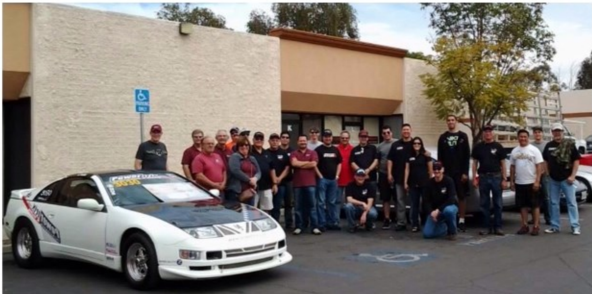
ZCSD, Empire Z, ZCCIV, Z32 at Powertrix and San Diego Auto Museum