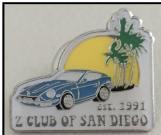
VINTAGE CLUB PINS $5.00 each