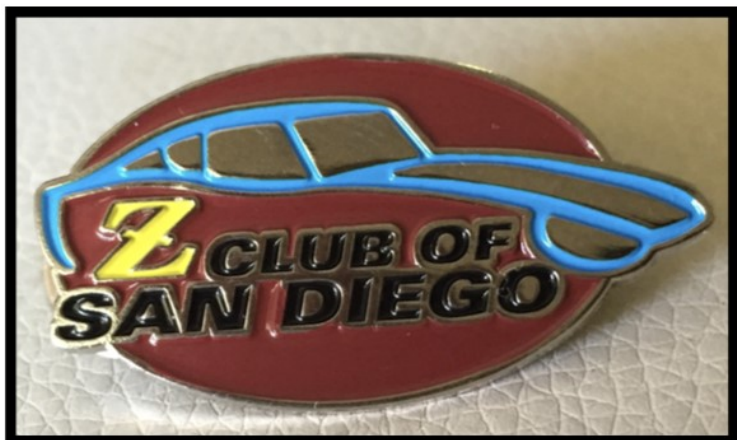
NEW CLUB PINS $5.00 each