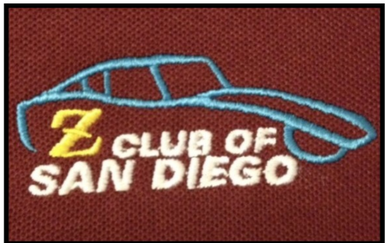
CLUB SHIRTS AND HATS ARE IN $15.00