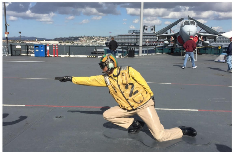
These are some of the many airplanes in display