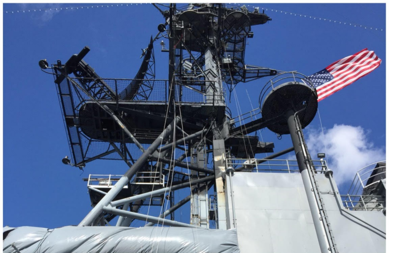
The view from the flying deck and the inside of the control room the Midway is amazing