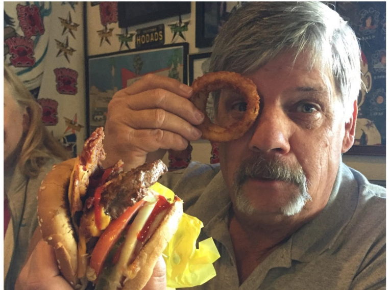
We had a great time and delicious lunch at Hodad's downtown , San Diego