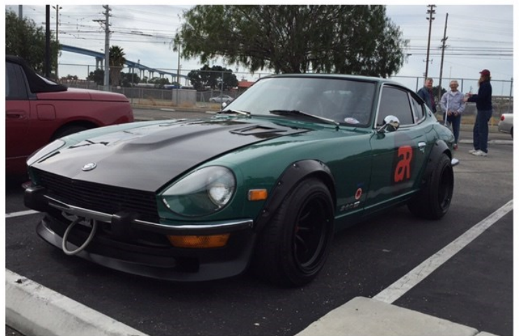
Good looking Z car at K1 Speed