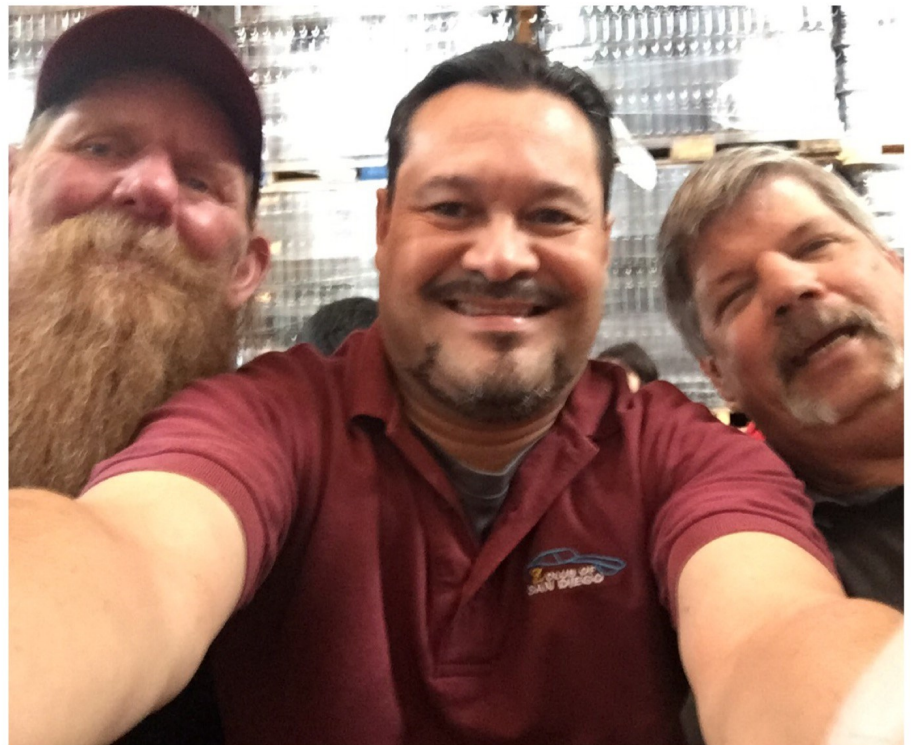
Our last stop was Mission Brewery for some beer tasting