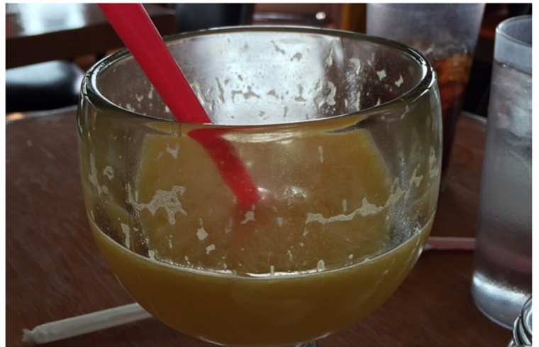
Lunch at New Mexico Café , best meal after a great morning of Go Kart racing.