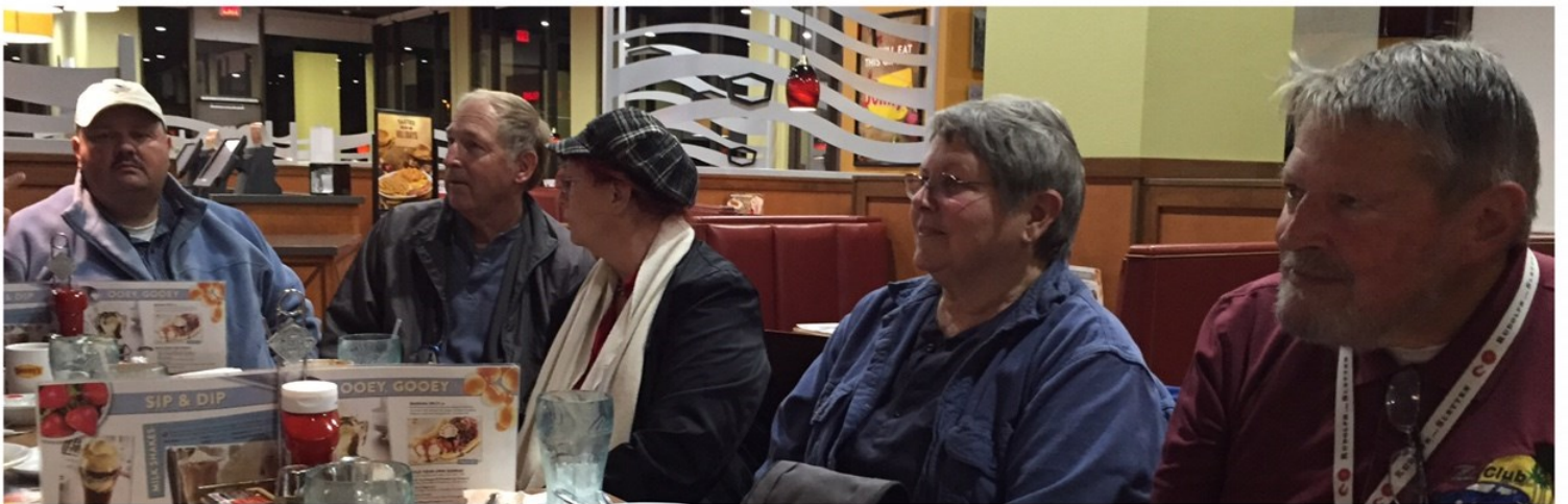
A few brave souls battle the weather for the January 2016 General Meeting