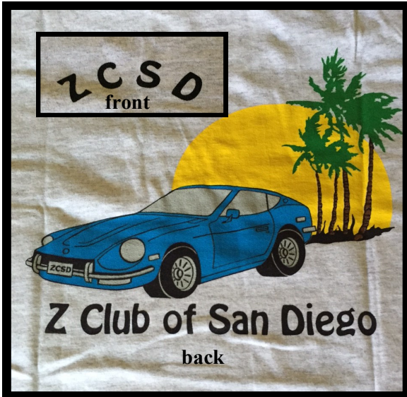
VINTAGE CLUB SHIRTS $10.00 (Limited sizes)