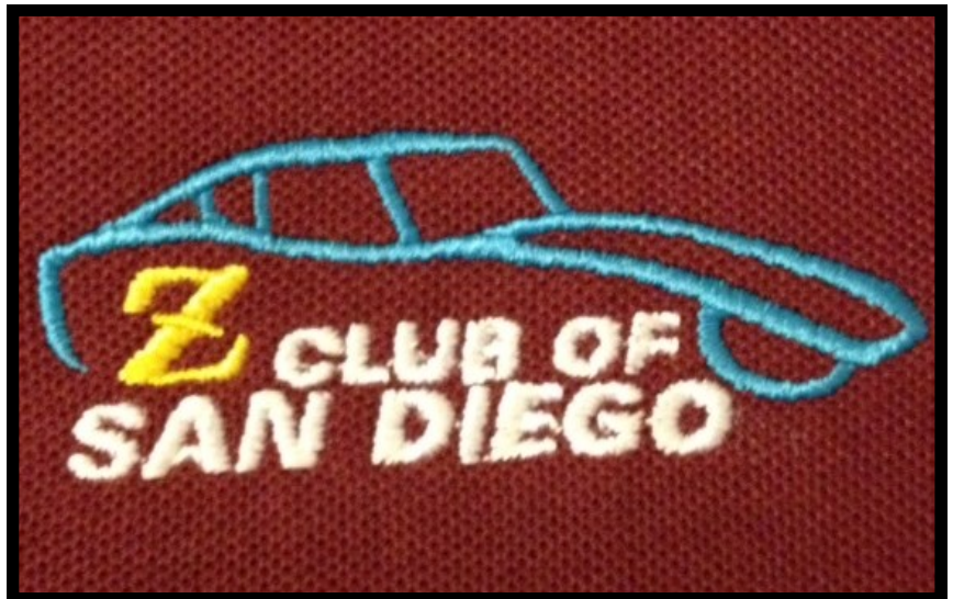
CLUB SHIRTS AND HATS ARE IN $15.00