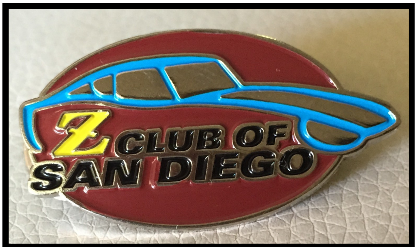
NEW CLUB PINS $5.00 each