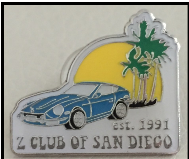
VINTAGE CLUB PINS $5.00 each