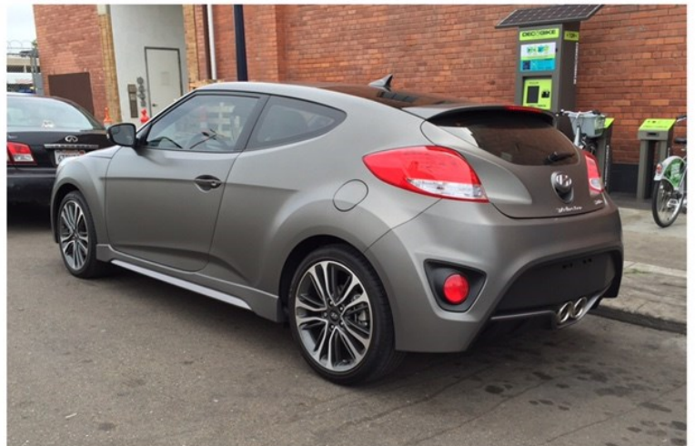
Lenny's new car , no it is not a Z car, but a Hyundai Veloster (turbo)