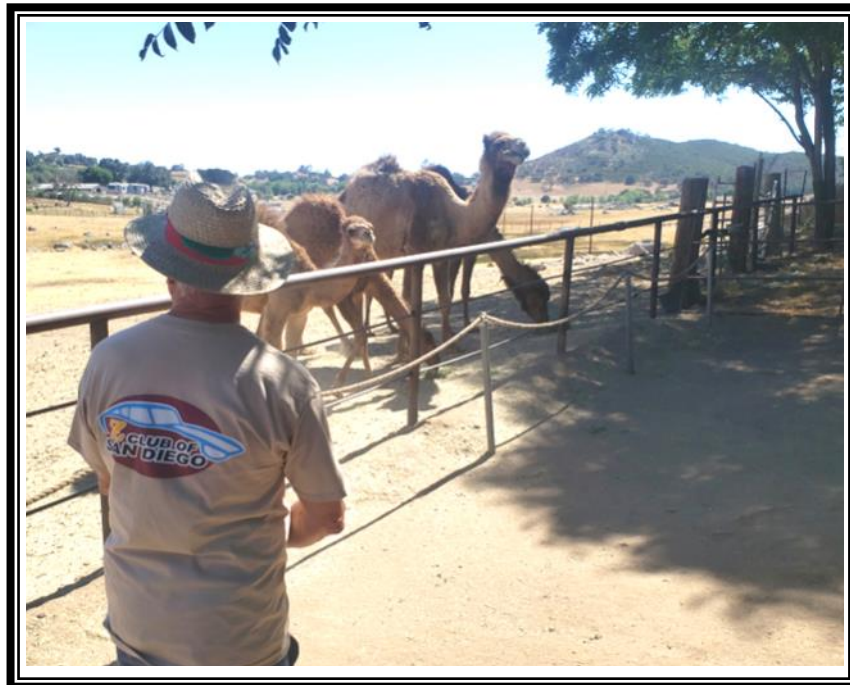
Enjoying Time With the Dromedaries At the Oasis Camel Dairy, June 12, 2022