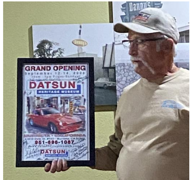
Collector's Poster at Auction