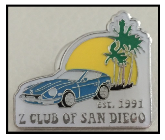
VINTAGE CLUB PINS $5.00 each