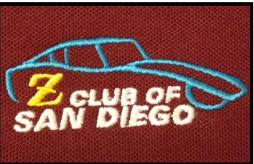
CLUB SHIRTS AND HATS ARE IN $15.00