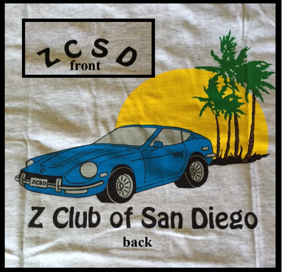
VINTAGE CLUB SHIRTS $10.00