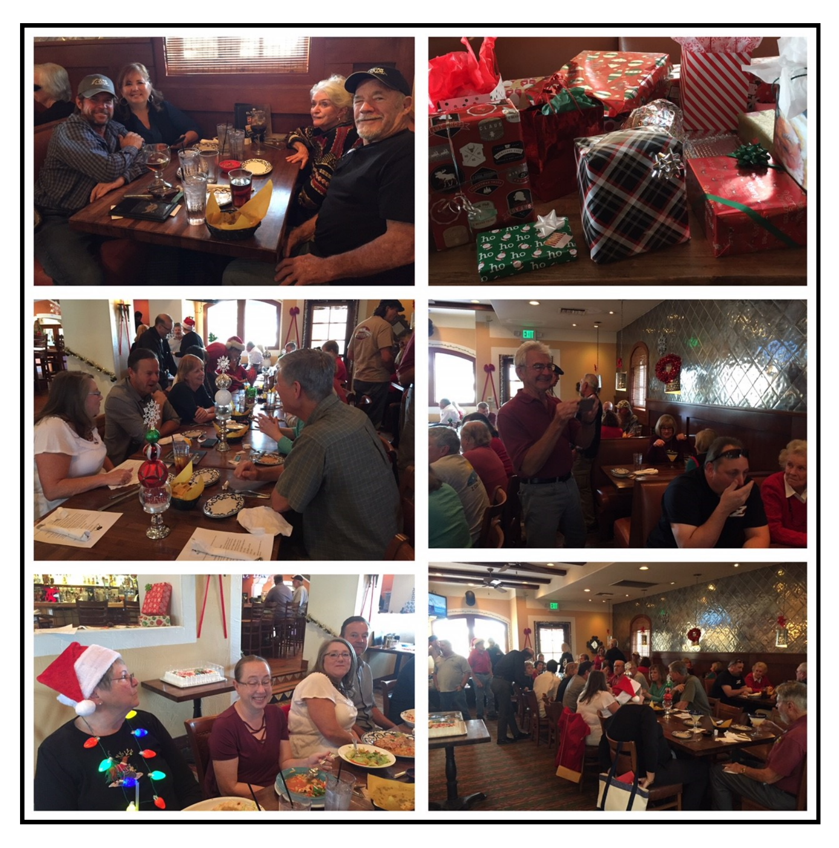
Our toy drive was for the Boys and Girls Club, thanks for all your kind donations.