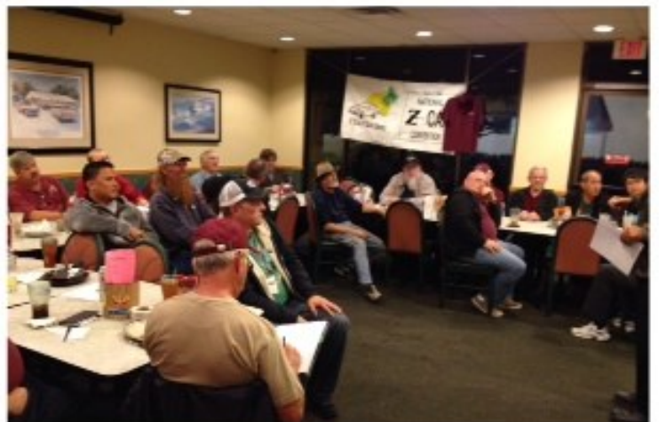
Full House at The ZCSD December General Meeting Tony from Zero Paint talked about full n partial car wraps and the different wrapping materials available in the industry.