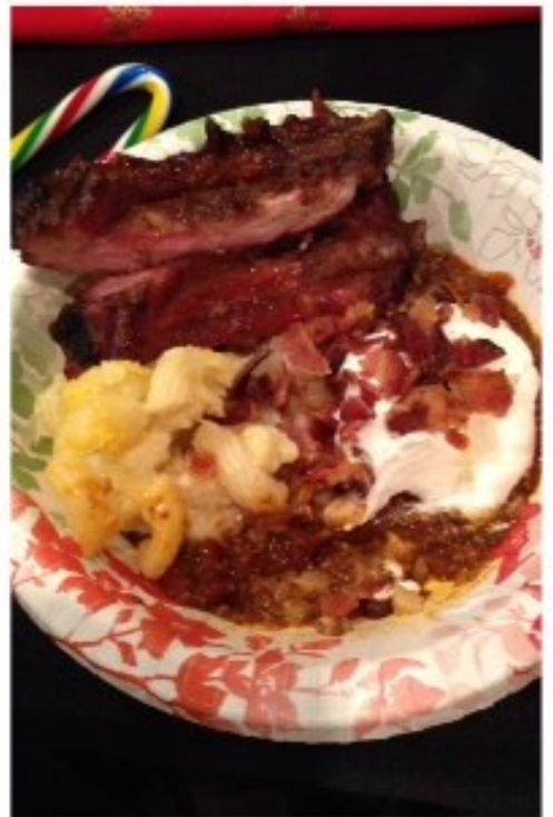
ZCSD December Board Meeting at Casa de Cook