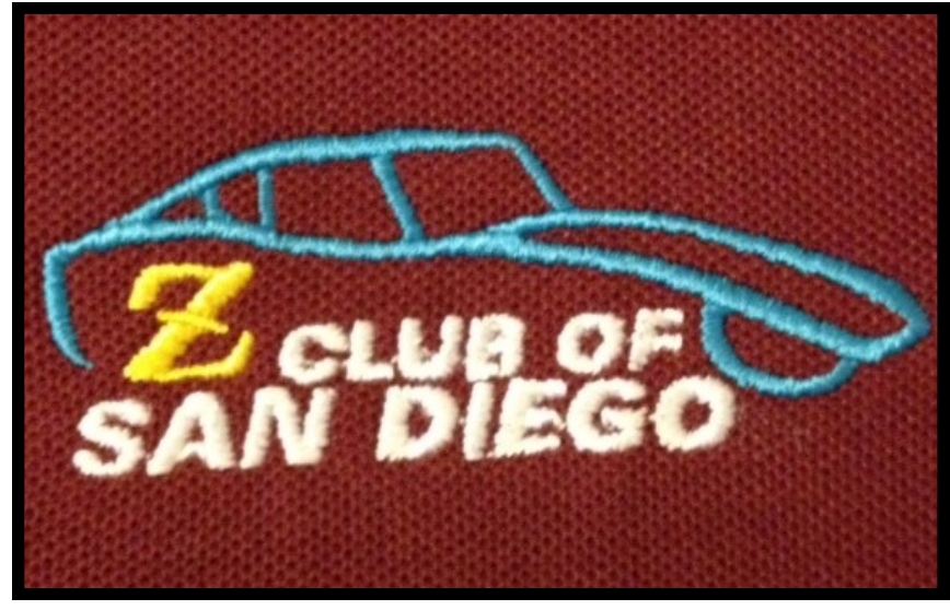
CLUB SHIRTS AND HATS ARE IN $15.00