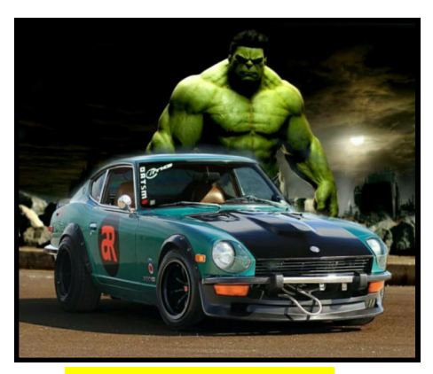
ZCSD? Straight ahead!!!