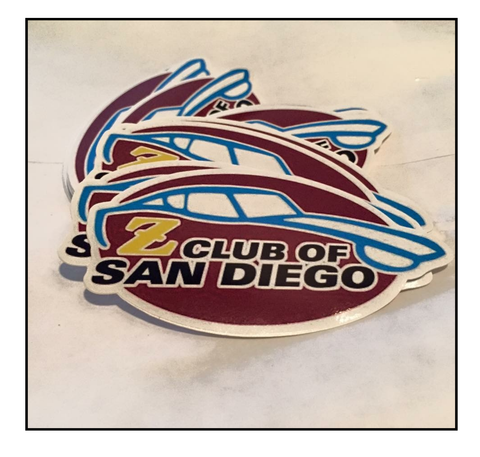
Club stickers are in !!!! Limited quantities