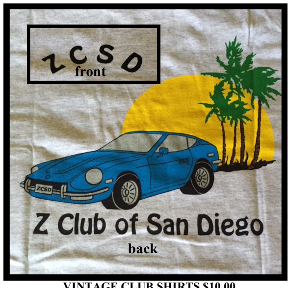
VINTAGE CLUB SHIRTS $10.00