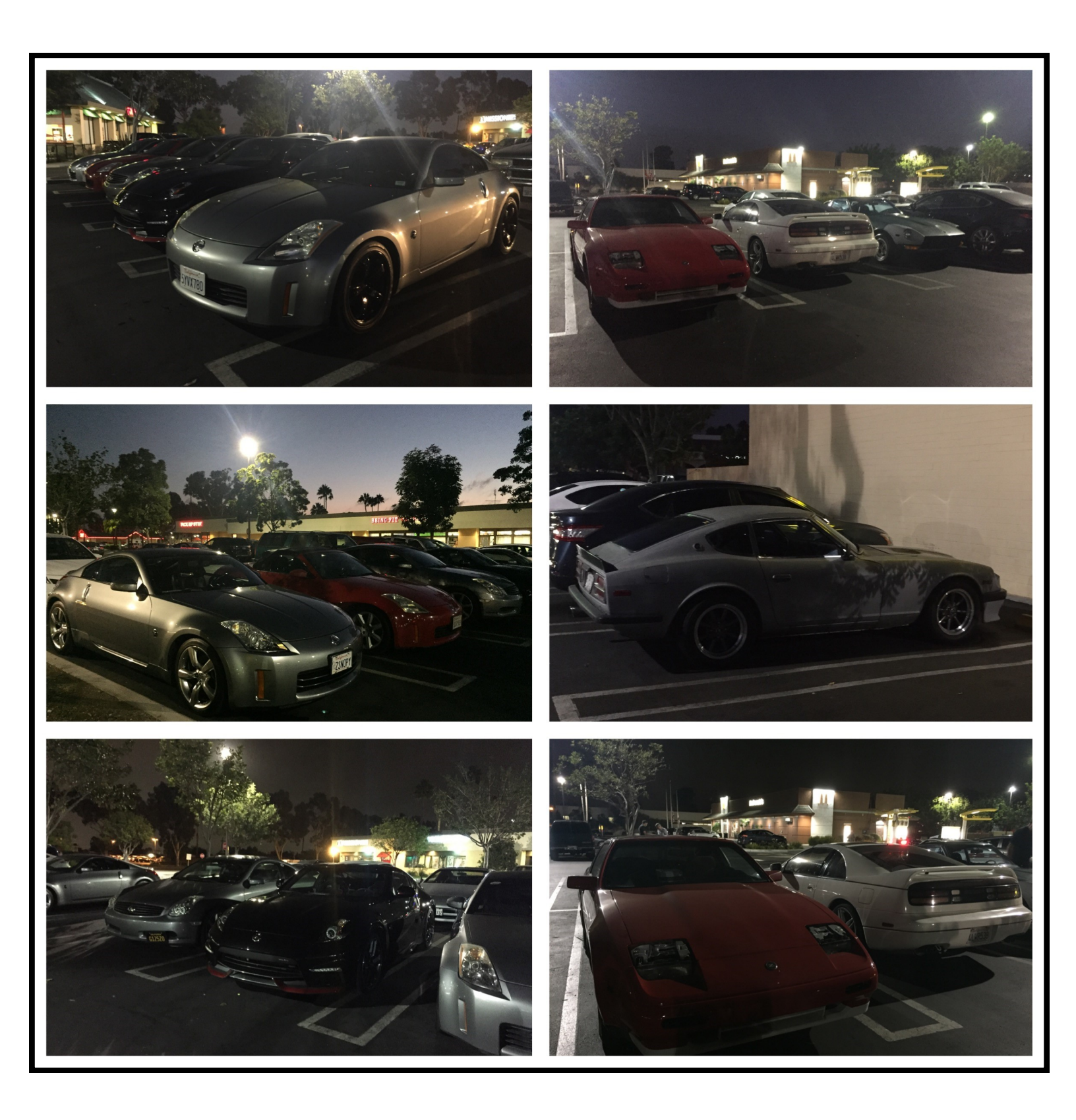
We had some nice Z car in the parking