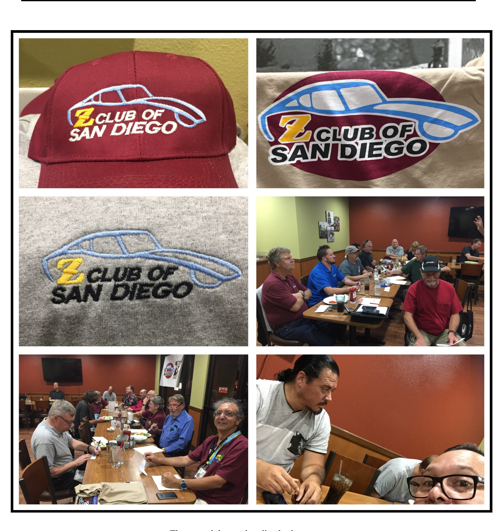
The new club merchandize looks awesome