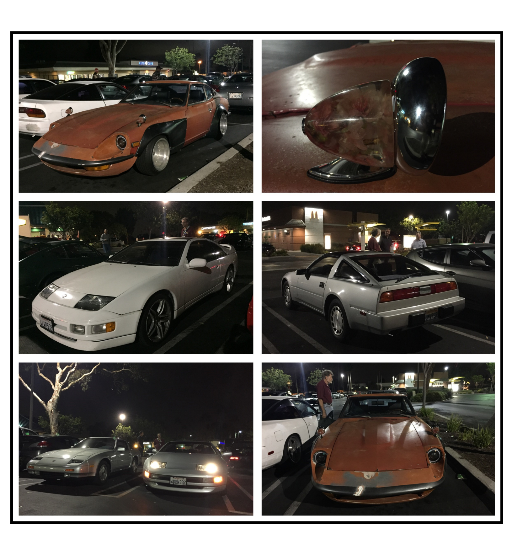
Love it or hate it ,but G-nose Z cars are awesome