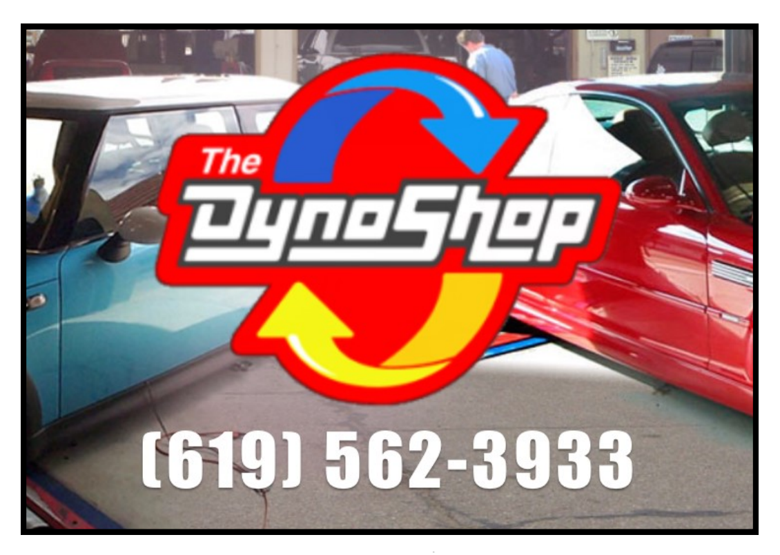
10042 Prospect Ave. Santee, CA 92071

The Dyno Shop is San Diego's premier performance and automotive repair facility. We provide expert automotive maintenance, auto repair and auto tuning service for your car, truck, off-road vehicle, motorhome or hot rod. From engine repair or transmission repair to oil change and smog check, we will get the job done. If you own a business, we will repair and maintain your automotive fleet so you can be more productive. We would love the opportunity to be your choice for all of your automotive service needs.