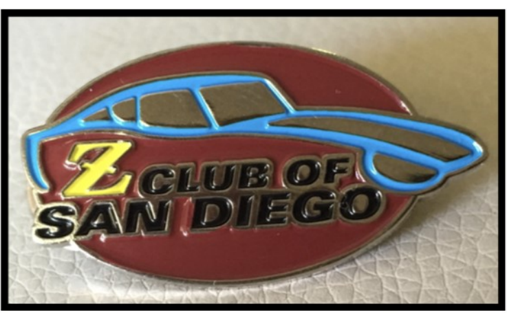
NEW CLUB PINS $5.00 each