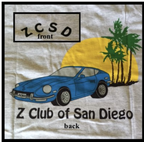
VINTAGE CLUB SHIRTS $10.00