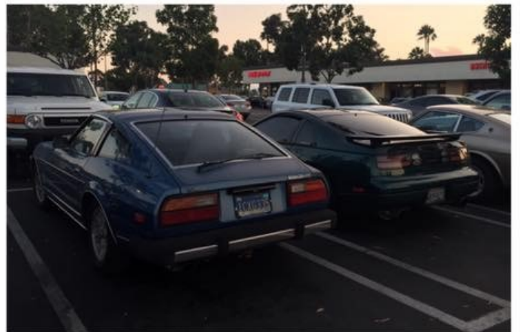
We had some nice Z car in the parking