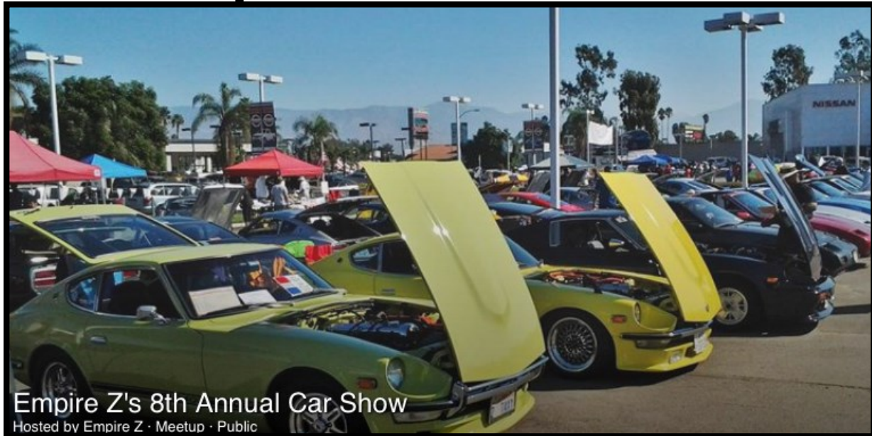
Empire Z's 8th Annual Car Show Hosted by Empire Z · Meetup · Public

26015 Jefferson Ave, suite A Murrieta, CA 92562