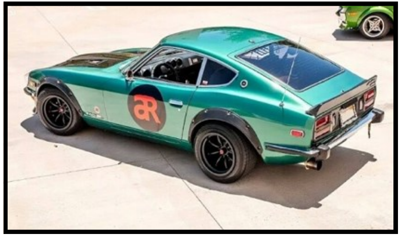
ZCCIV Car show, October 26, 2014