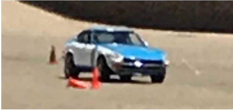
Wally Cook in his 1972 240-Z

Until further notice all events have been CANCELLED due to COVID-19