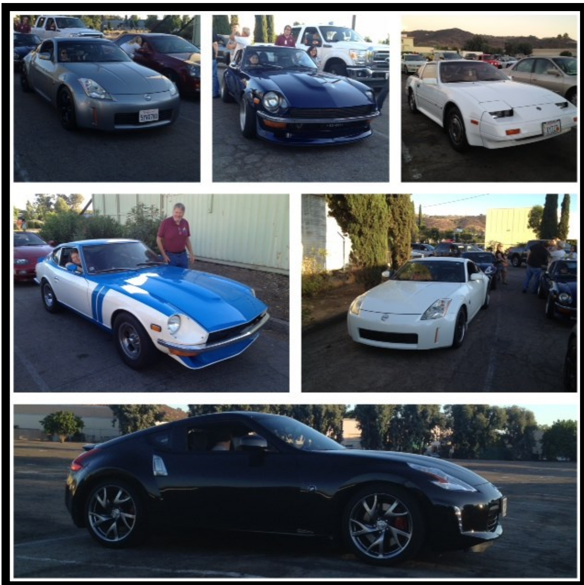
ZCSD Drive In Movie Night

NEXT GENERAL MEETING IS AUGUST 6 TH AT DENNY'S in the Clairemont Square Shopping Center (See Page 2)