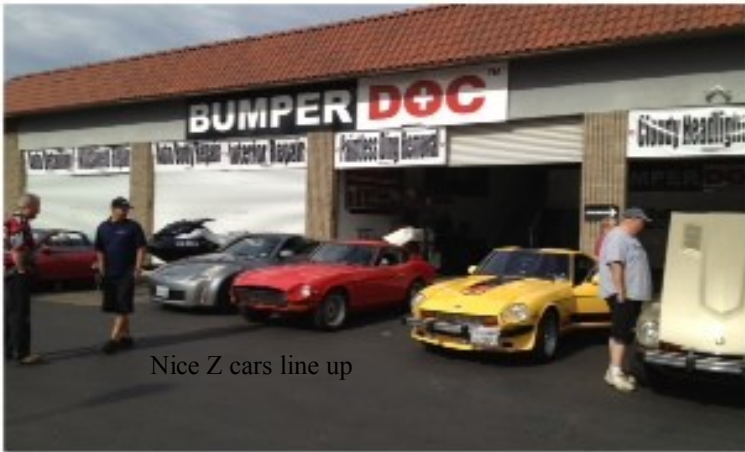
Nice Z cars line up