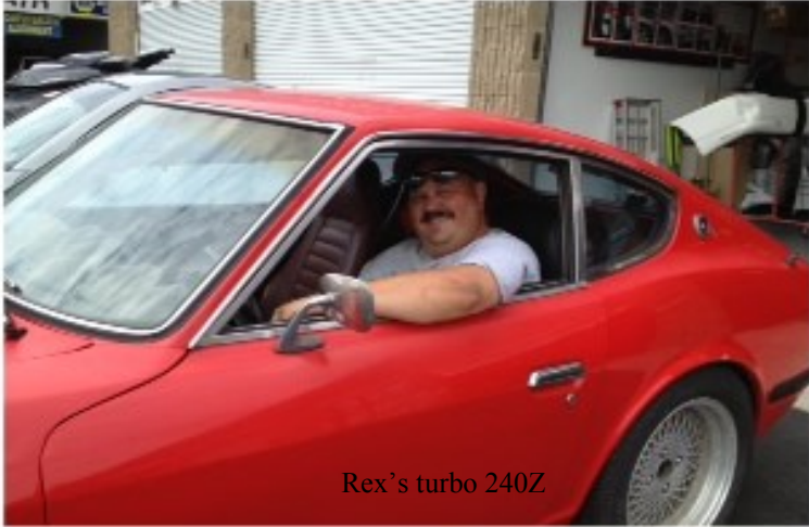
Rex's turbo 240Z