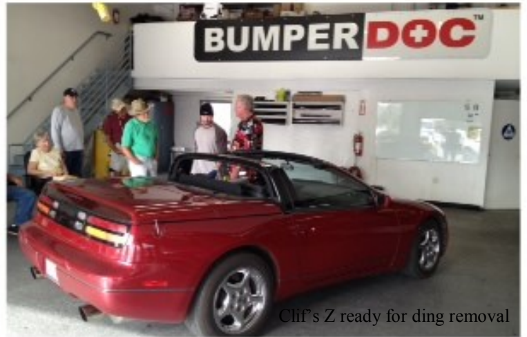
Clif's Z ready for ding removal