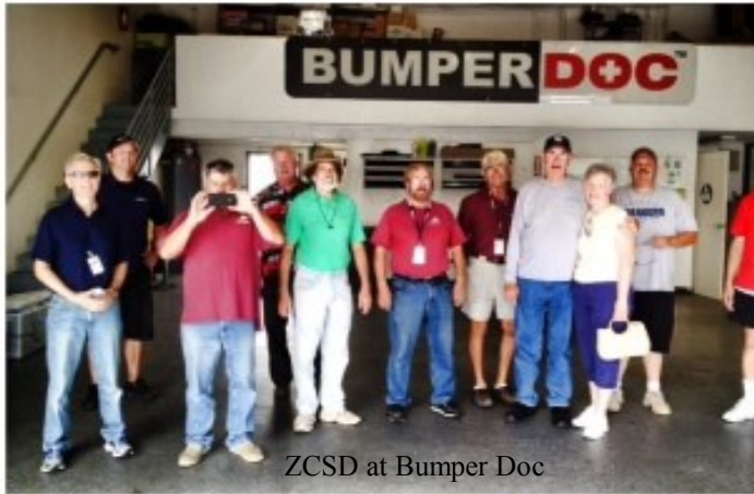
ZCSD at Bumper Doc