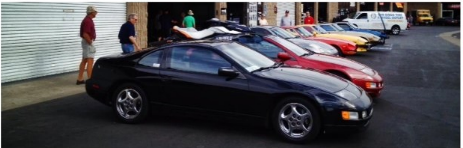
ZCSD Z cars looking pretty at the Bumper Doc Tech. Session