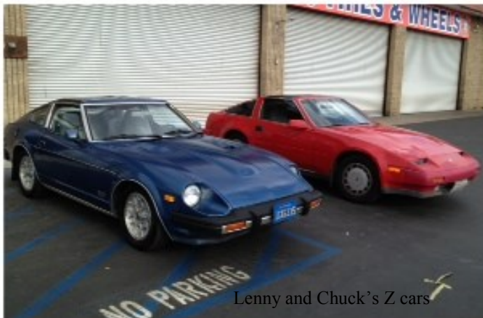
Lenny and Chuck's Z cars