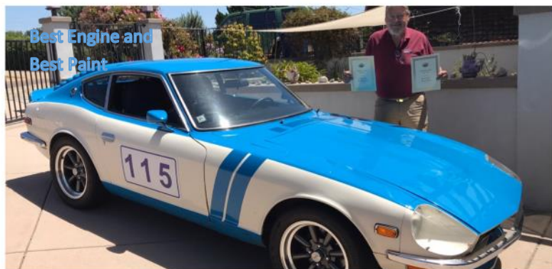
Best Engine and Best Paint