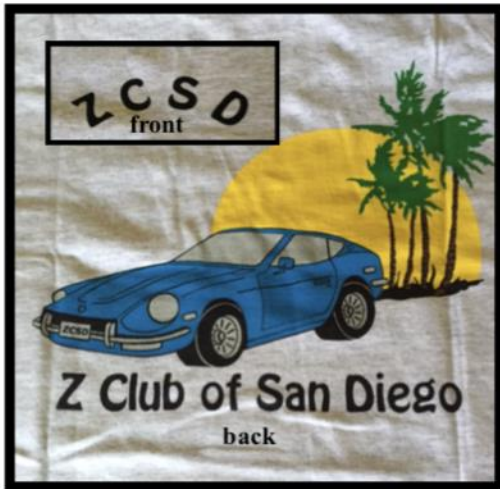
VINTAGE CLUB SHIRTS $10.00 (1.50 extra for tax)