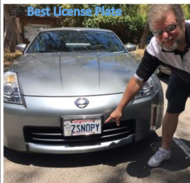
Best License Plate