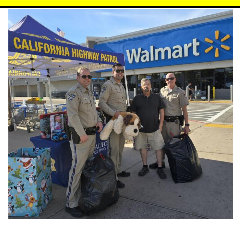
Holiday Party & Toy Drive