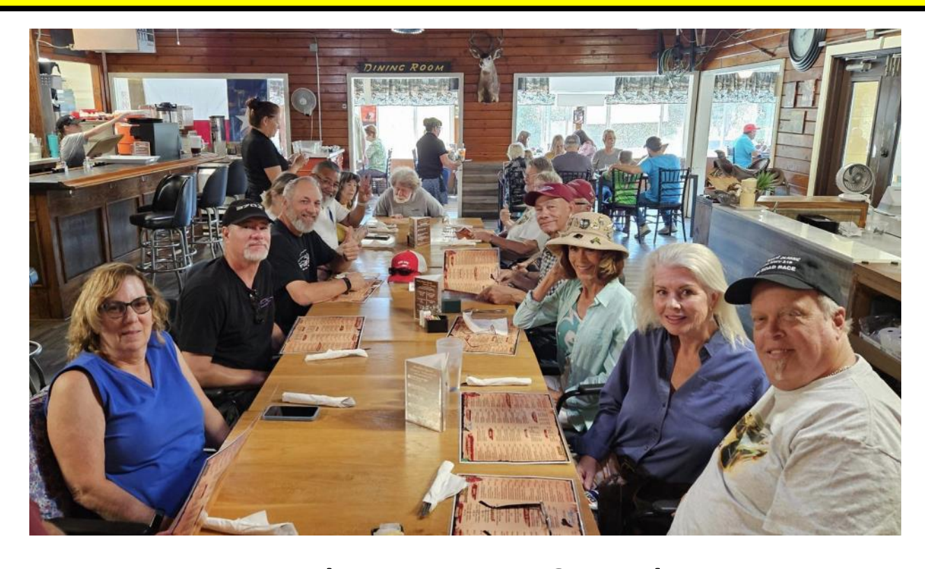
North County Cruz & Lunch