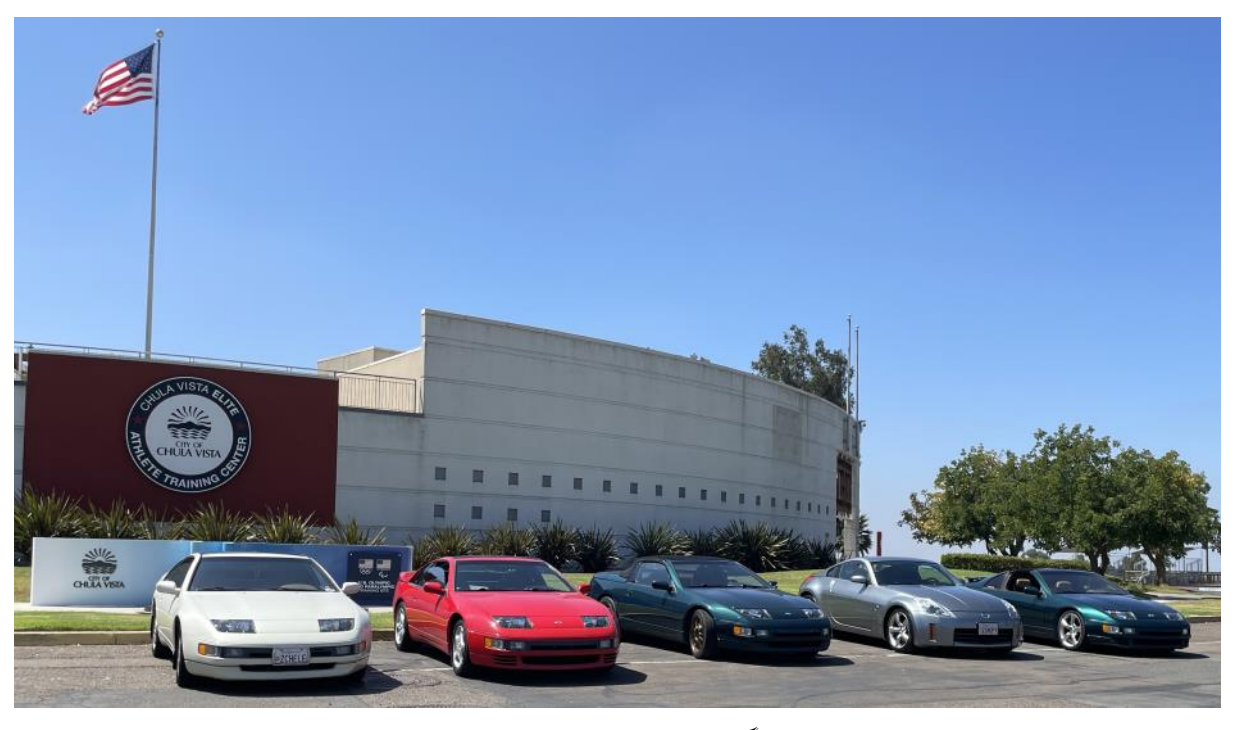
ZCSD AUGUST CRUZ - VISITS THE

CHULA VISTA ELITE ATHLETIC TRAINING CENTER