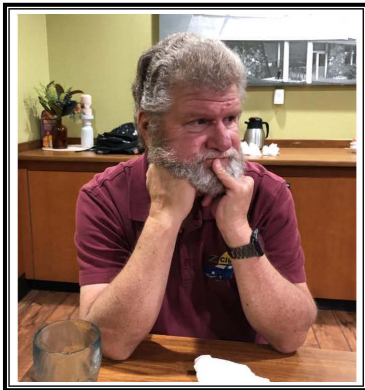
The Prez Sez

Come Early and Enjoy Your Dinner Before the Meeting!