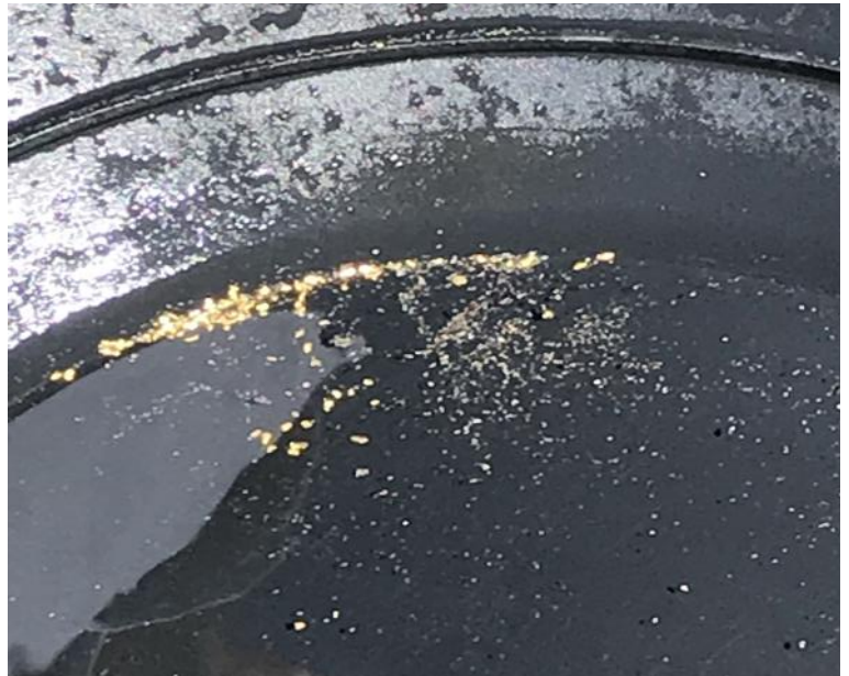
Pan for GOLD

We will stop at Dudley's to pick up sandwiches (or pack your own picnic lunch) and then on to the Eagle Mining Co. where there are picnic tables for us to enjoy lunch. After the tour you can try to strike it rich and pay for your next Z Car.