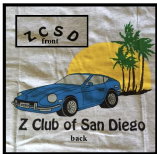
VINTAGE CLUB SHIRTS $10.00 (1 limited edition)