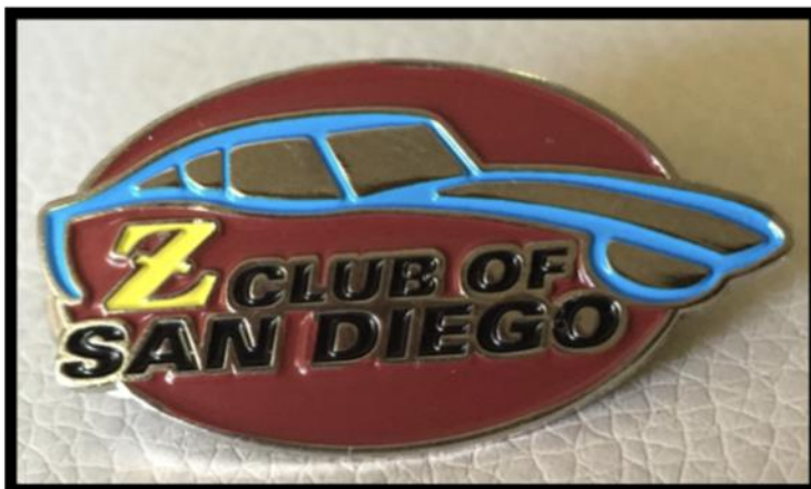
NEW CLUB PINS $5.00 each