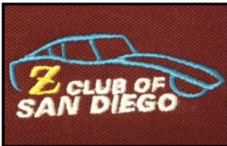
CLUB SHIRTS AND HATS ARE IN $15.00