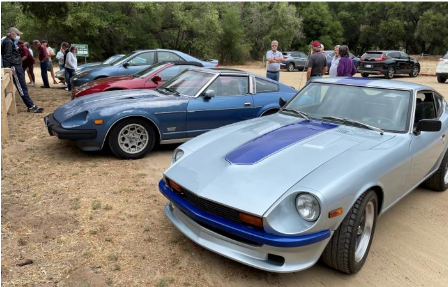
The gang at the first rest stop.