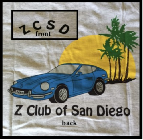
VINTAGE CLUB SHIRTS $10.00