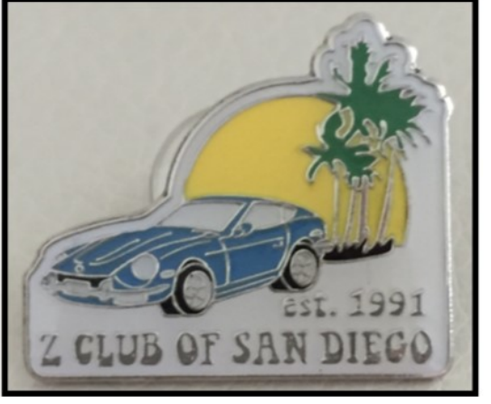
VINTAGE CLUB PINS $5.00 each