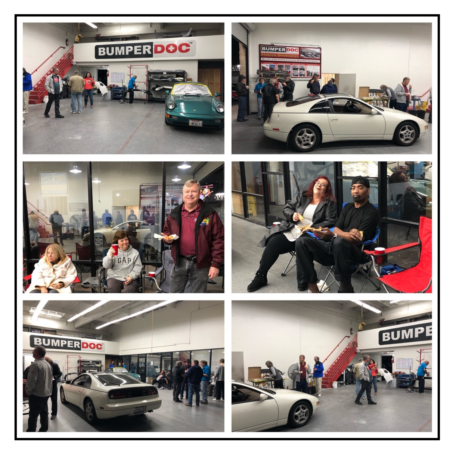
ZCSD January 2019 General Meeting was held at Bumper Doc at 3885 Convoy St, San Diego, CA 92111