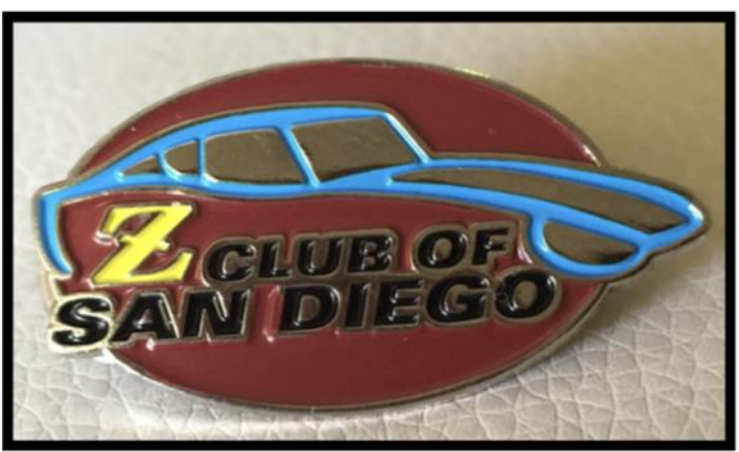
NEW CLUB PINS $5.00 each