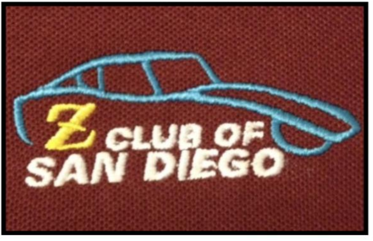
CLUB SHIRTS AND HATS ARE IN $15.00