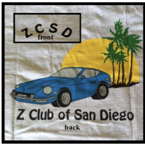
VINTAGE CLUB SHIRTS $10.00